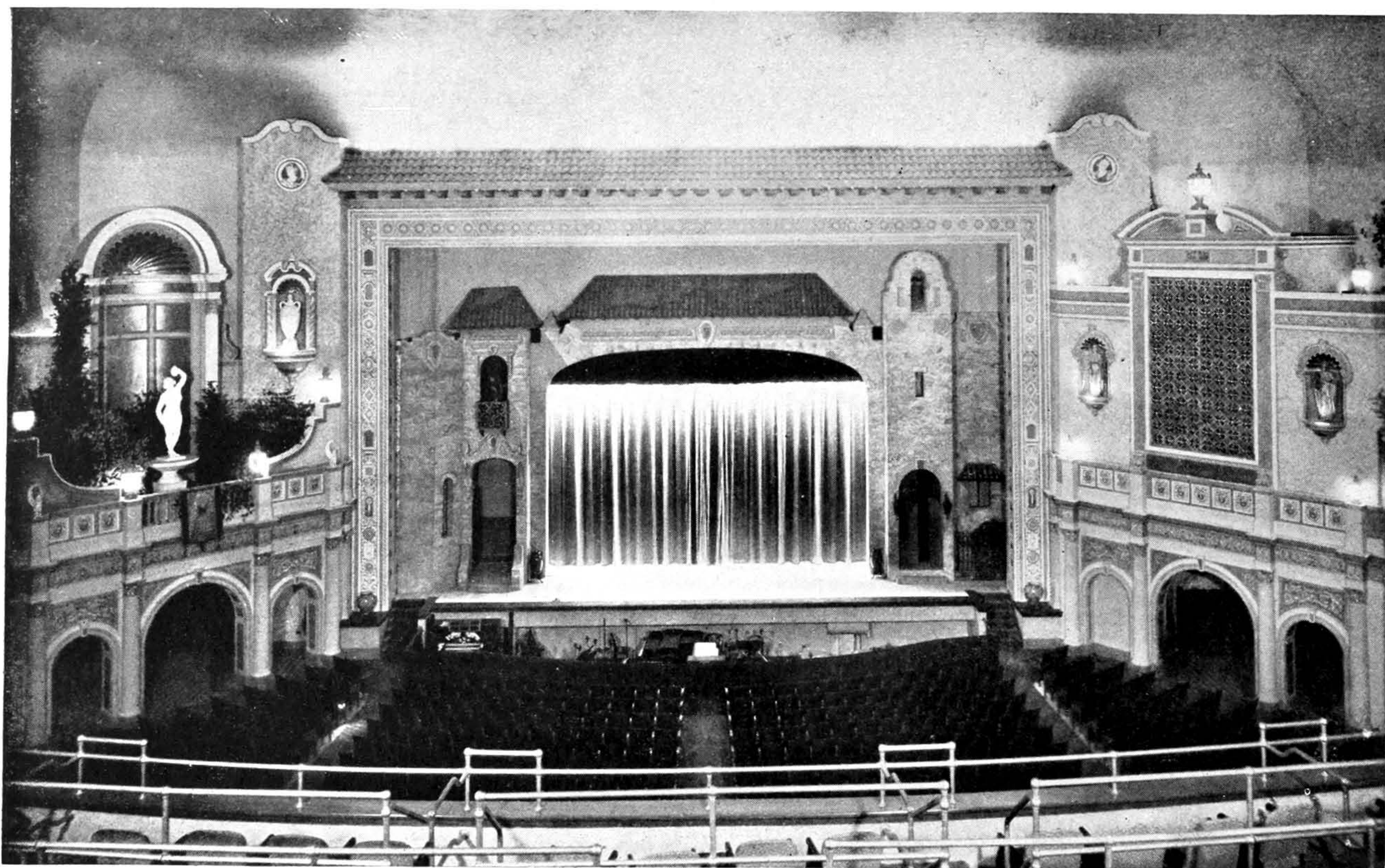
General view of the Granada Theatre auditorium, featuring an adaptation of Spanish architecture done in the atmospheric style. Preston G. Bradshaw, architect.

The Granada, Operated by Loew's, Has Seating Capacity of 2,500