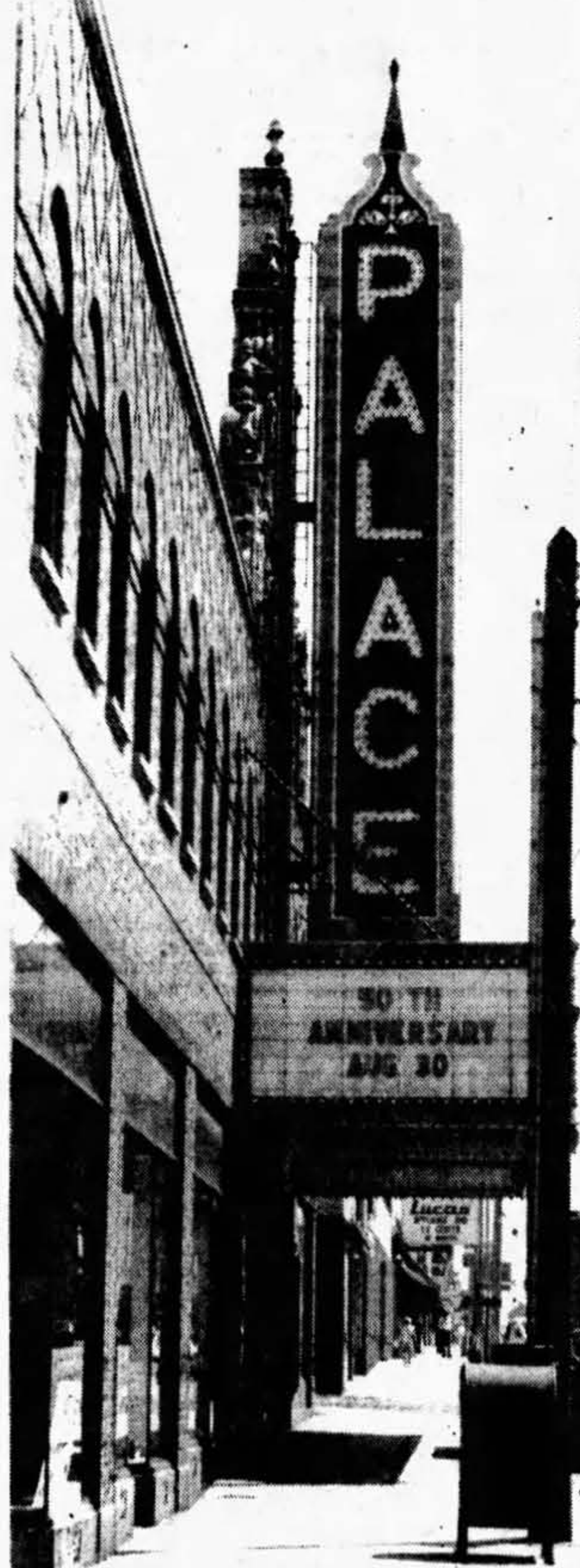
Theater Marquee Announces The Celebration

280 W. Center St. Persons wanting to display art works in the show can enter their pieces Aug. 26 and 27. In addition, $500 in prizes will be awarded to art works dealing specifically with the theater, its heritage or the programs sponsored there. Entry categories include oil, acrylics, watercolors, drawings, graphics, mixed media, photography, sculpture, pottery and textiles. Various activities have been planned to present an evening of entertainment in honor of a theater that will celebrate its 50th anniversary because of community support which enabled complete restoration of the vintage gathering place.