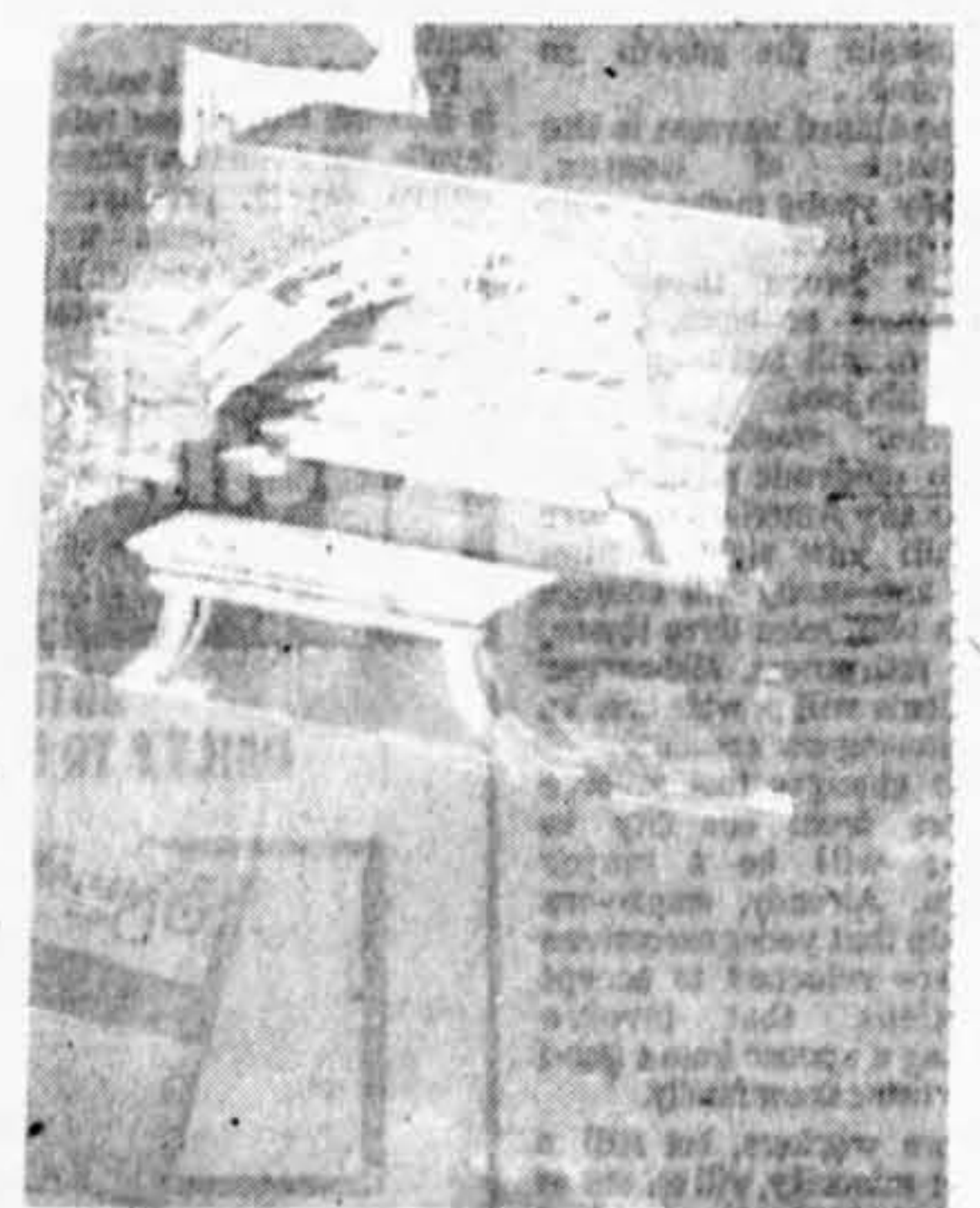
Unveiling Of The "Mighty Wurlitzer" Will Highlight The Festivities