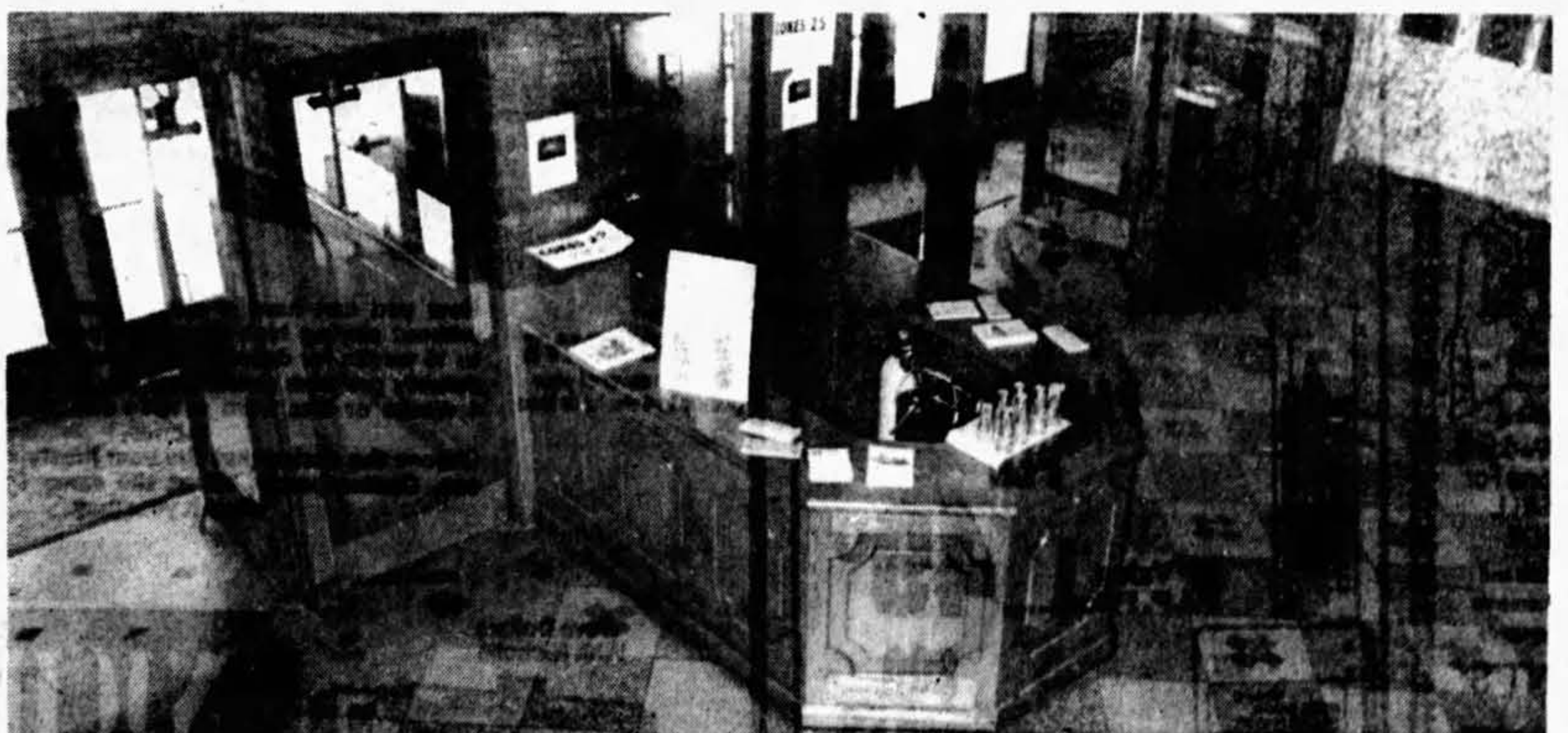
Volunteers Donate Time To Operate The Ticket Booth And Concession Stand Area