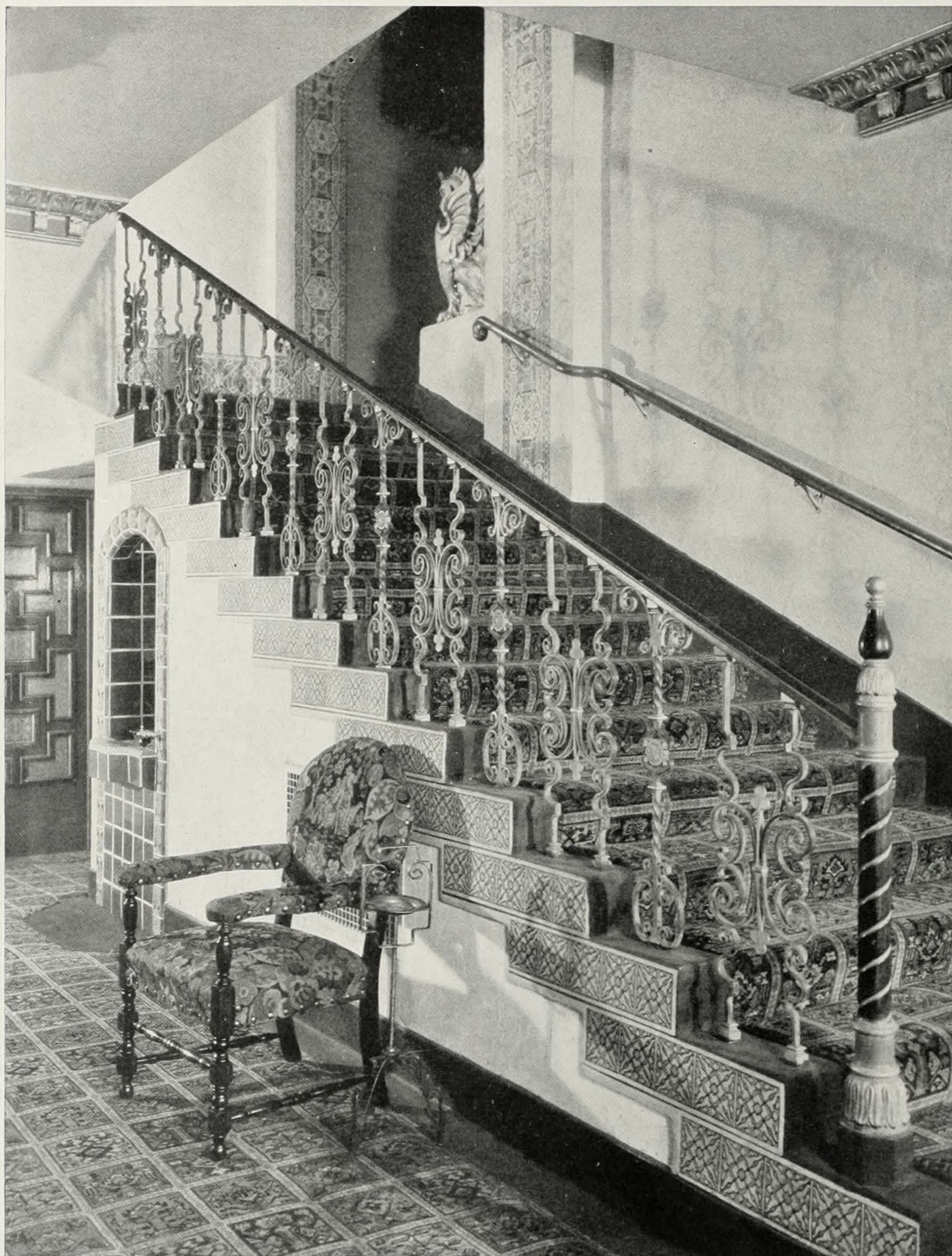
STAIRCASE TO MEZZANINE, UPTOWN THEATER, SAN FRANCISCO FABRE & HILDEBRAND, ARCHITECTS