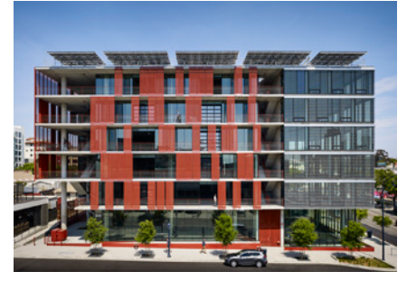
49 | Block D Makers Quarter

to the time of day and year. Manuallyoperated screens offer customizable shading levels to individual tenants within the highly flexible office suites. BNIM, 2018