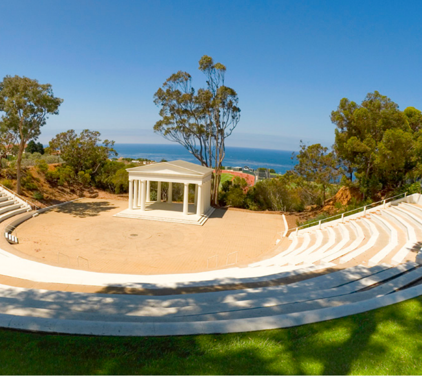
74 | Greek Amphitheatre at Point Loma Nazarene University