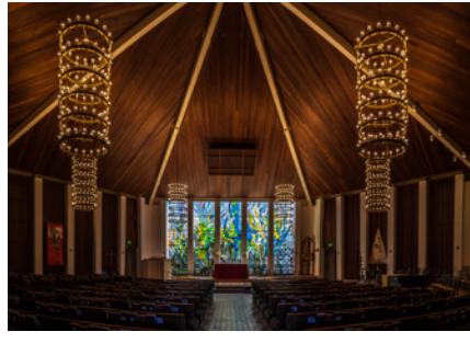
Oliver Asis | All Souls' Epsicopal Church