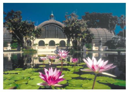
6 | Botanical Building

This "must-see" San Diego destination was built for the Panama California Exposition and was one of only four Balboa Park structures intended to be permanent. The unique domed lath