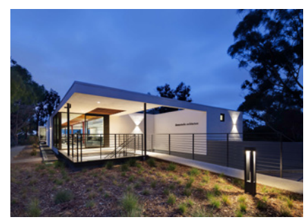
21 | domusstudio architecture

The 1960s-era building served as a medical office for over 50 years and eventually became a blight and blocked views from the neighborhood into Maple Canyon. Honoring the original architect's legacy and its mid-century bones, the building was transformed by adding expanses of glass and removing all interior walls to make it as transparent