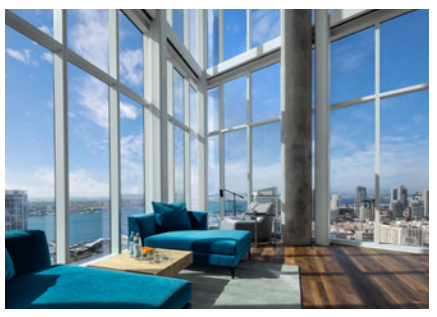
58 | Park 12

Located across the street from Petco Park, this luxury residential and retail community features a striking multitiered design, with four buildings -a 37-story tower high-rise and three mid-rise buildings –connected by a pair of above-street bridges evoking the open-space feel of New York's High Line park. The mixed-use project is rich in amenities, with classic and modern finishes. A dramatic, cascading staircase welcomes residents and guests at the property's street entrance. Carrier Johnson + CULTURE, 2018