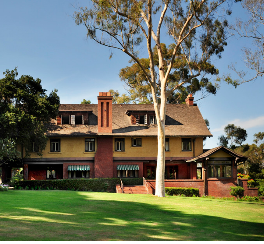
19 | Marston House Museum & Gardens

Visit the Bankers Hill hub to help plan your weekend and pick up your passport.