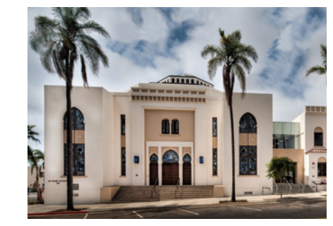
15 | Ohr Shalom Synagogue

Named after its reputation for being home to the affluent and their many mansions built in San Diego's heyday by some of its most notable architects including Irving Gill—Bankers Hill is located west of Balboa Park with easy access across the historic Cabrillo Bridge. It is a desirable residential location with bay views available from many new luxury high-rise condos.