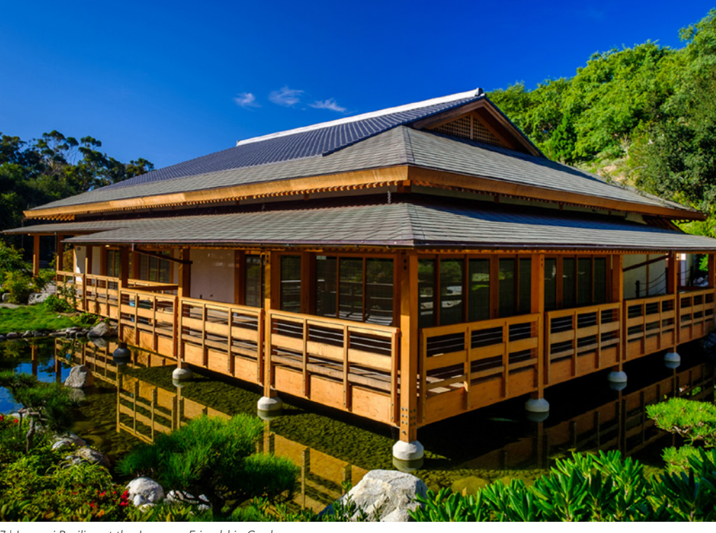
7 | Inamori Pavilion at the Japanese Friendship Garden

The largest cultural complex west of the Mississippi, Balboa Park is sometimes called "The Smithsonian of the West" for the impressive concentration of cultural institutions within its boundaries. Originally built for temporary use during the 1915–16 Panama-California Exposition, the buildings here are beautiful enough to be considered attractions in themselves. The real draw is the culture, history, science and arts held within their walls. Highlights include eight gardens, 15 museums, a Tony Award-winning theater and the San Diego Zoo.