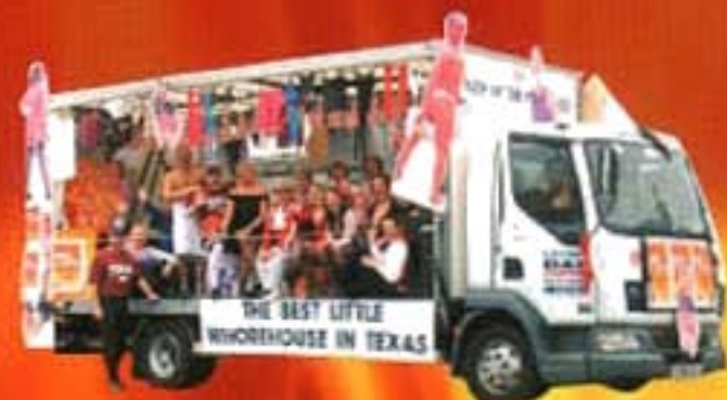
Fringe Cavalcade Festival Second Prize