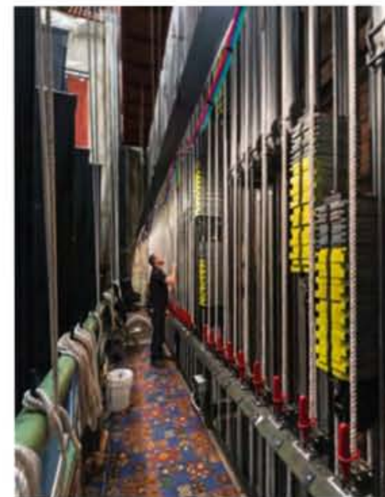
Top: The Altria Theater, which is located in Richmond, Virginia, is a popular venue for touring Broadway shows