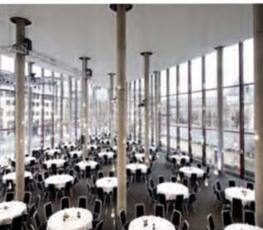
From top: In addition to work on the Grieghallen's main concert hall, the renovation also included the smaller Peer Gynt-salen and supporting spaces.

knowledge of venues – old and new – for future-proofing for the next generation. I've worked in many different venues globally, and I use tried-and-tested best practices from each to deliver the most efficient, practical systems possible."