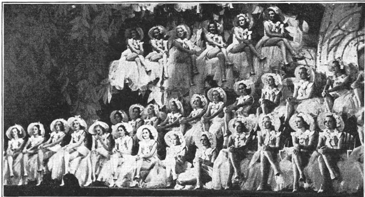
An actual performance photograph of the George White beauty chorus singing one of the song hits in "Scandals"