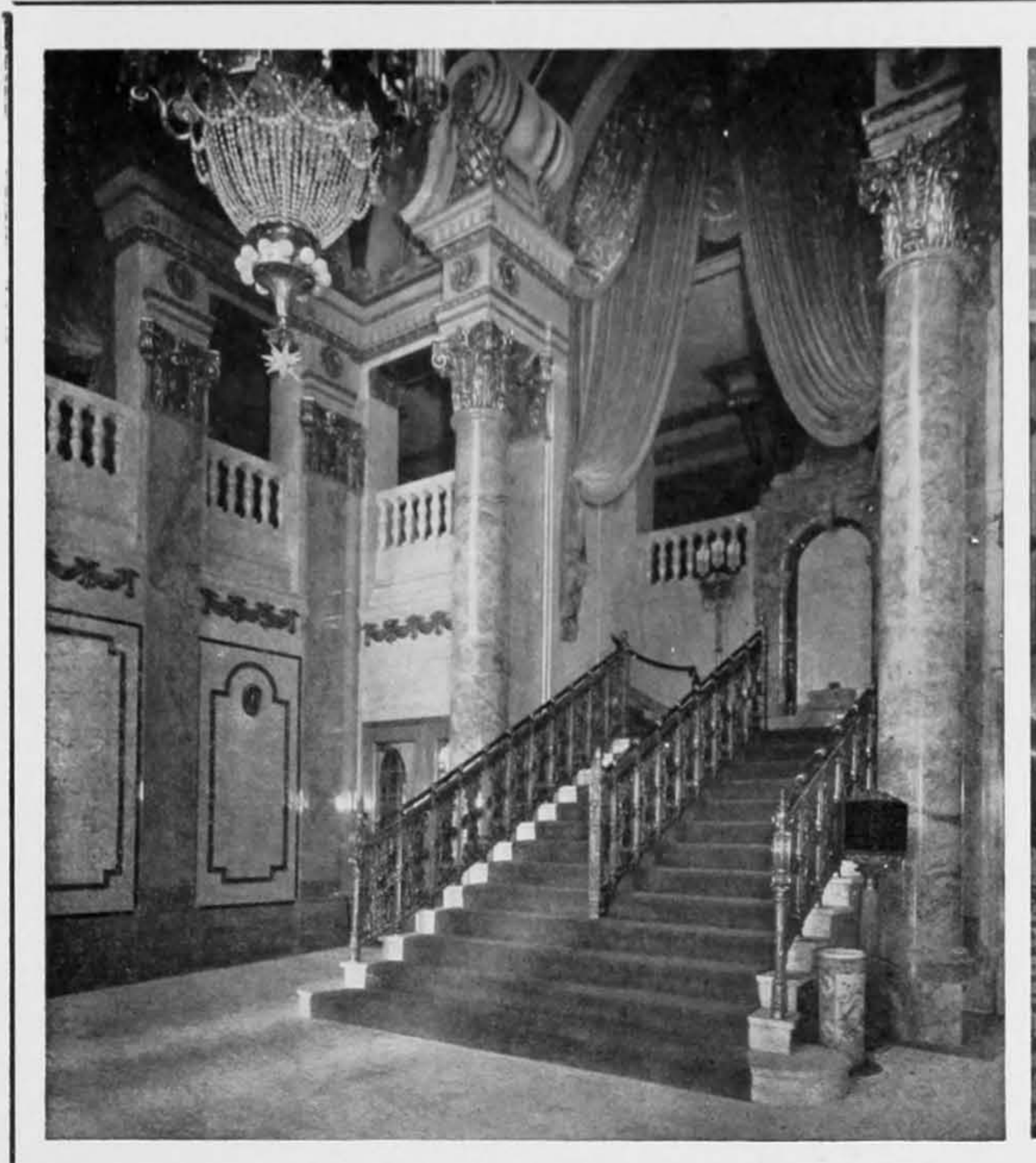
The main stairway located at the end of the grand hall, achieving on a small scale the impression of strength and dignity which is one of the outstanding effects of the massive de luxe picture theatres.