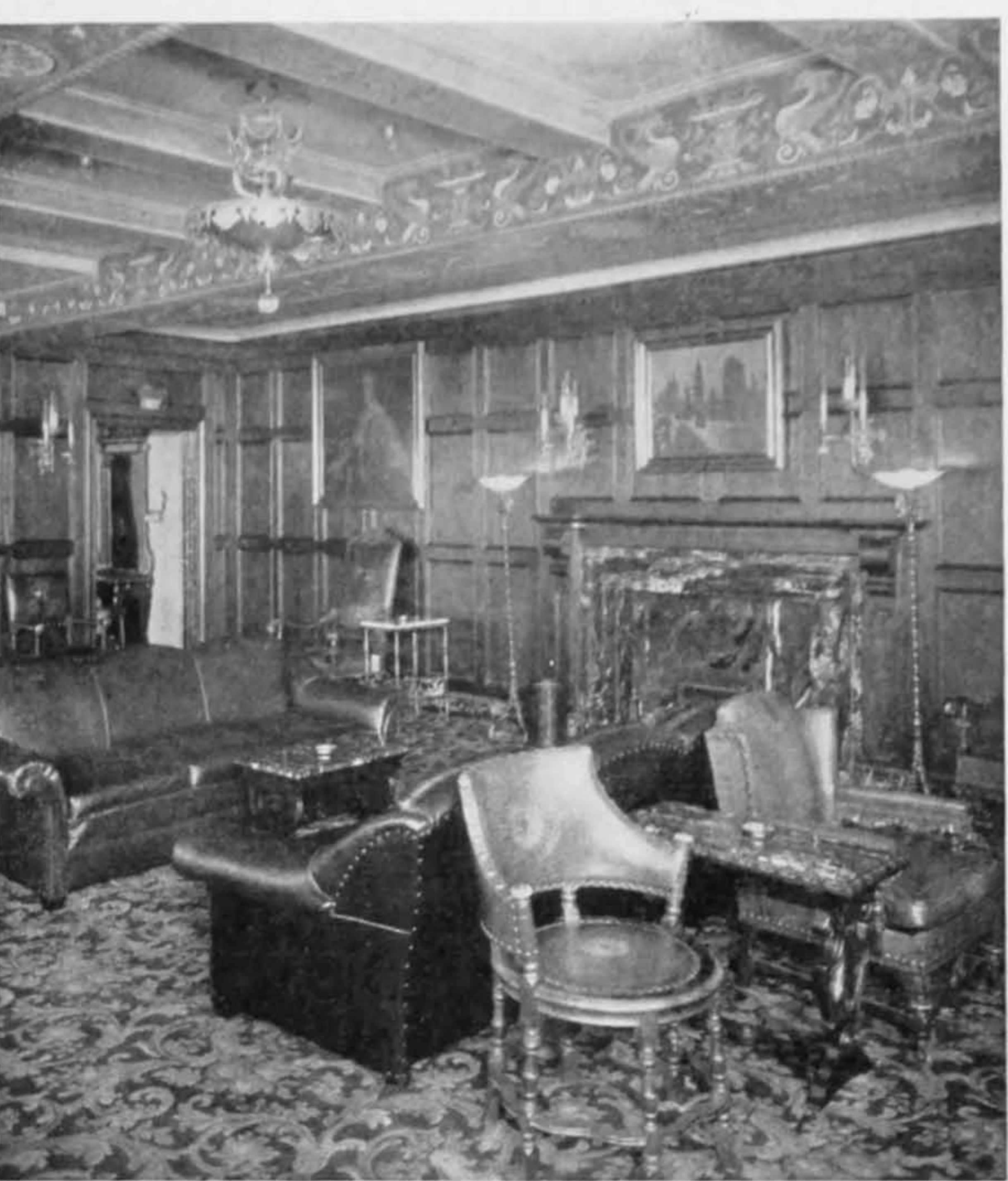
The main lounge, a luxuriously appointed resting place for the patrons of the Tower theatre. There is spaciousness and a richly comfortable note in the decorative treatment and furnishings found in this lounge.