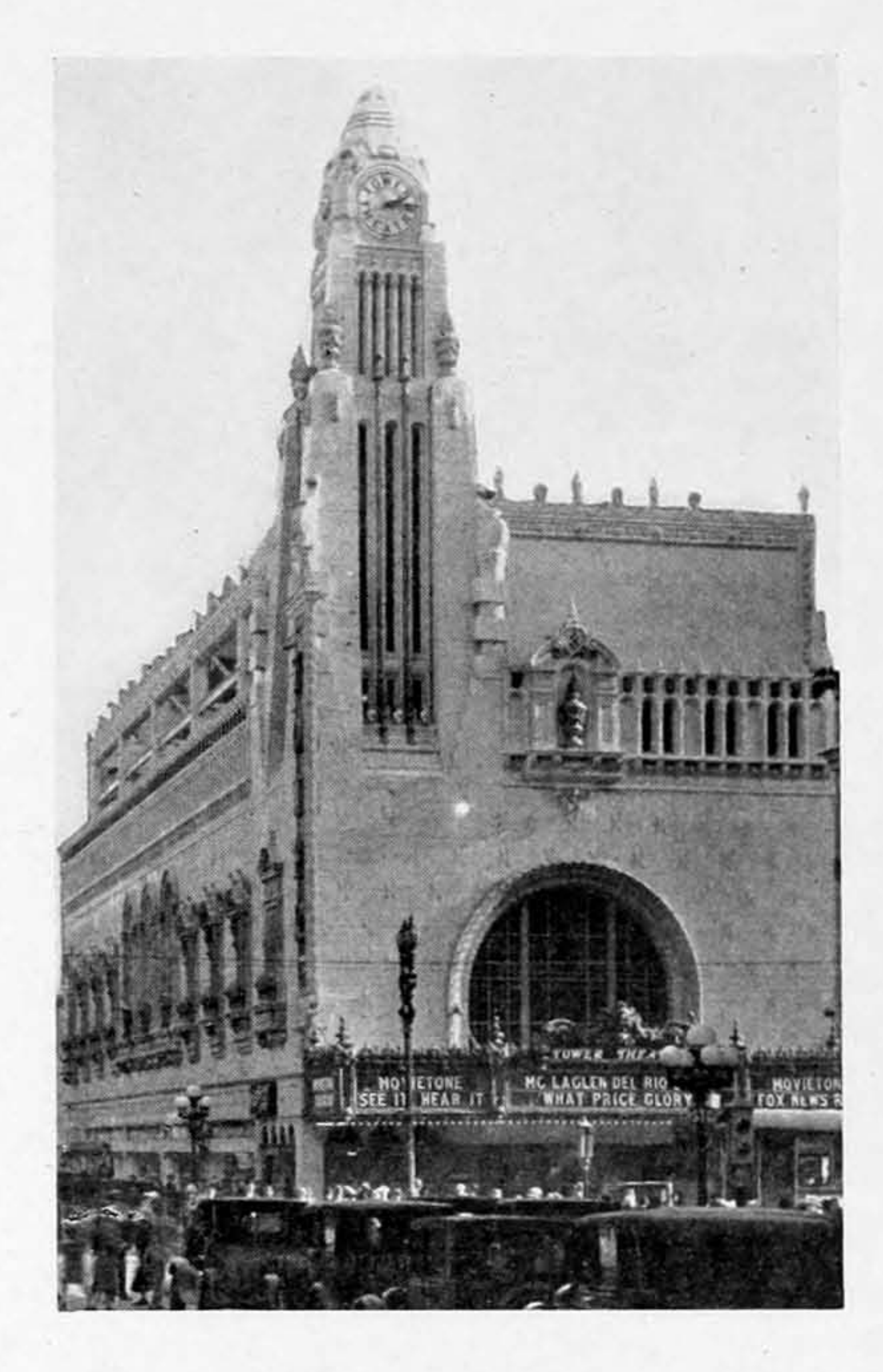
The exterior design features a large clock tower and offers an interesting adaptation of the French Renaissance style of architecture

The interior of the house is done in French Renaissance. The lobby is French Napoleon and Italian Bottecino marble with bronze hand rails and bronze column caps. The auditorium has a very high, domed ceiling with exquisite mural paintings, and the balcony has an exit condition never before achieved, and upon this revolves the entire ingenuity of building this house on a fifty-foot lot. The basement con-